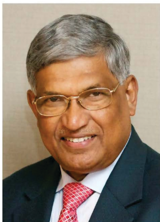
Enrolled Agent Certified Financial Planner ™

446 Main Street 16th Floor Worcester, MA 01608